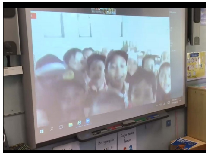
Zoom test meeting last week.