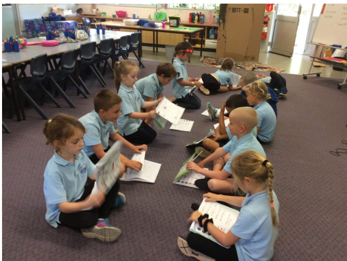
Kelas 1/2 in the Speed Conversation line up

Kelas 1/2 are following the speed dating system of a short time with one partner before moving on to another to practice conducting Indonesian conversations with each other. This is in preparation for their Zoom virtual meeting with students from our sister school in Jakarta. Our sister School is called MI Yasda.