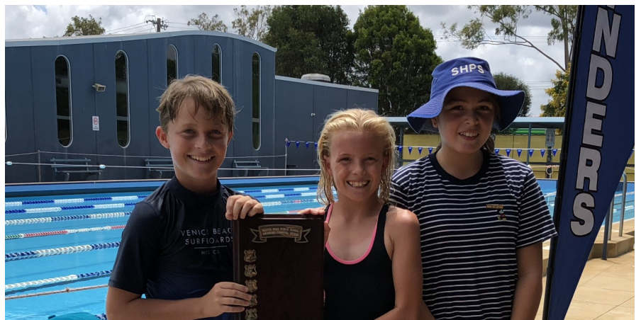
Proud Leaders of Flinders with the Shield