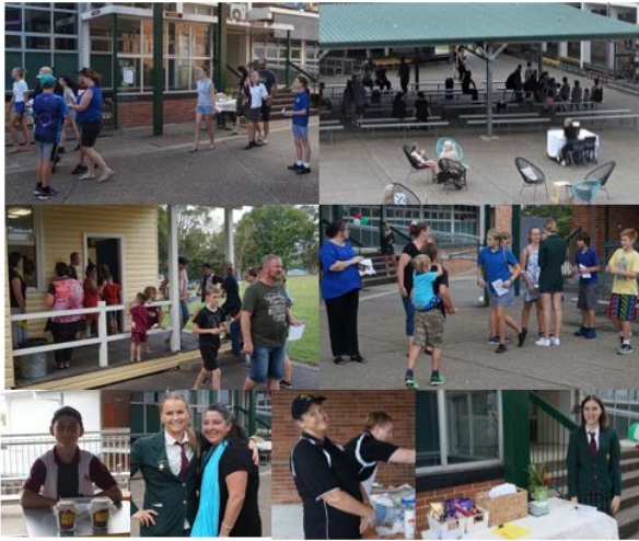
Follow us on Facebook - https://www.facebook.com/MacksvilleHHS/ P02 6568 1066 F02 6568 2802 E macksville-h.school@det.nsw.edu.au W www.macksville-h.school.nsw.edu.au 40 Boundary Street, Macksville NSW 2447

We trust you gained an insight into the vast array of subjects, activities, career paths and lesson plans the students have available to them here at MHS.