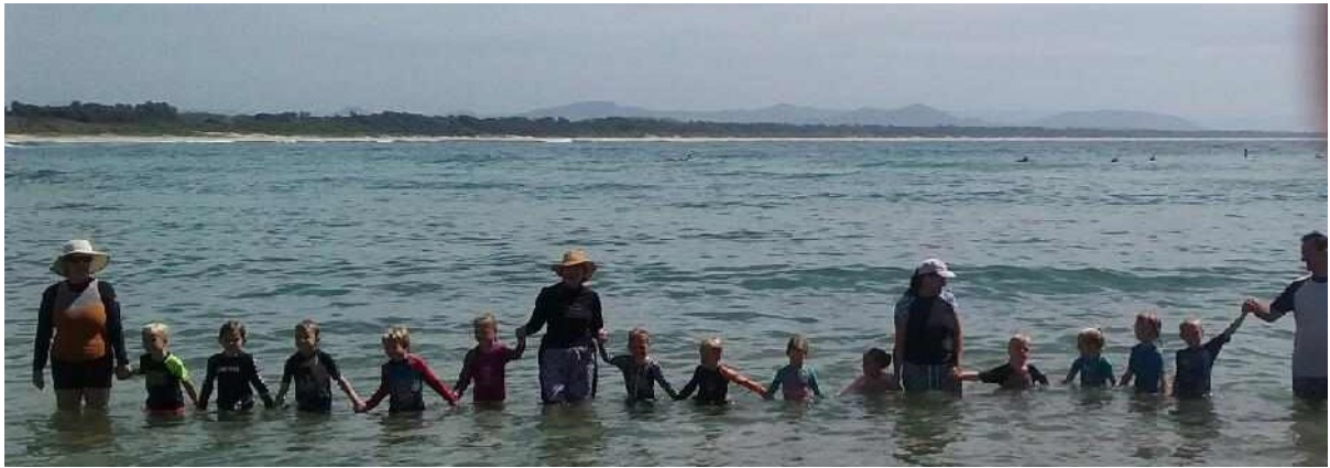
The Kindergarten/Year 1 students enjoying the beautiful conditions at the beach at the WAVES Program last Monday.