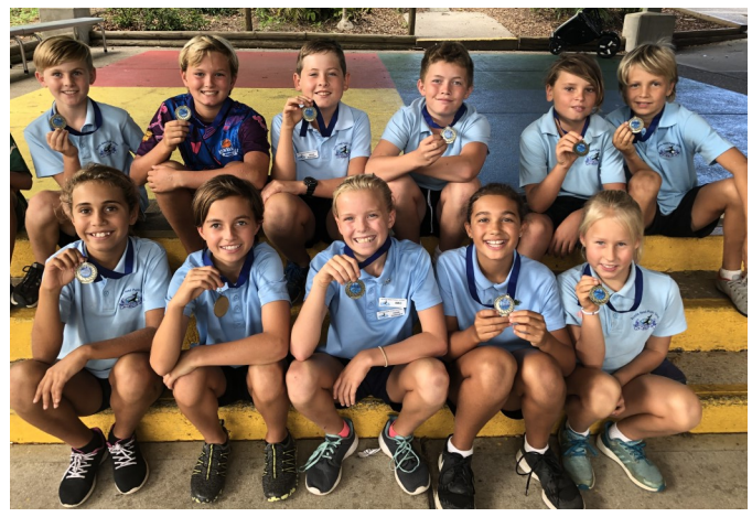
Above: Our swimming champions.