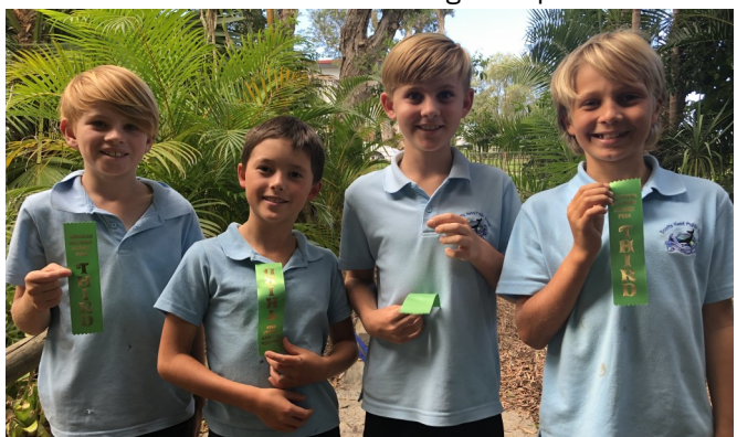
Junior boys relay team. Congratulations. The team came 3rd at the District Swimming Carnival.