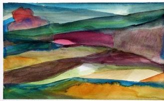
This year's theme is "landscapes"

So get cracking on a wonderful picture of a landscape. It can be any medium - paint, charcoal, pencil, oil pastel, collage materials use your creative imagination and talents.